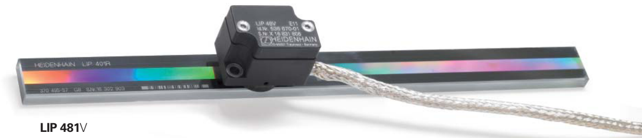
LIP 481 V